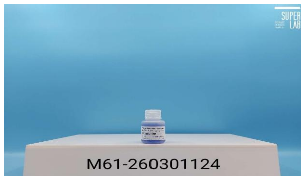
Figure 1: Test article.