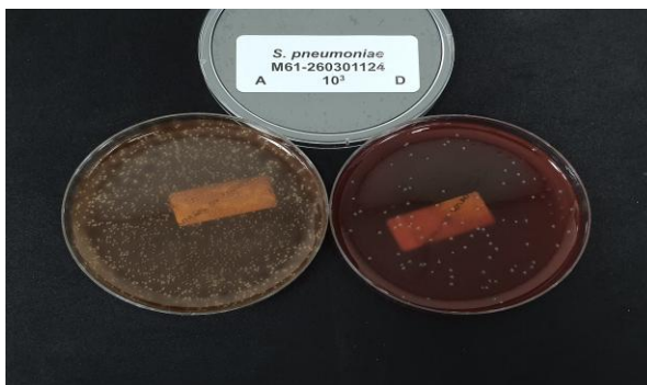
Figure 2: Result of control and test group.